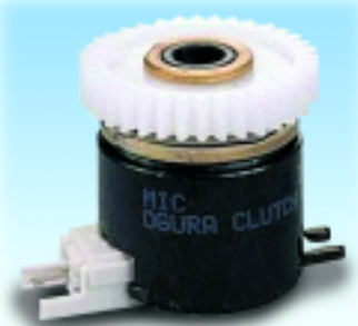
The MIC 2.5 NE series clutch

This unique application uses 18 Ogura MIC-2.5NE micro clutches per hand . . . the highest torque, smallest size clutches available today.