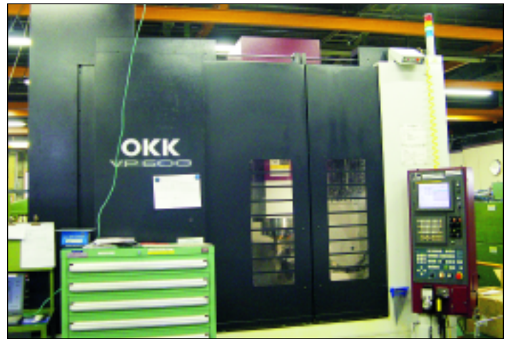
Set up of a new machining center

A new machining center was also purchased to cut the valve body for the hydraulic bypass valve used in the landing gear actuators. The previous machining on valve bodies involved initial machining on a lathe then transferring over to a separate milling machine then to another lathe for the final operation. A new multi-function machine was purchased and now all three operations are combined into one in one location.