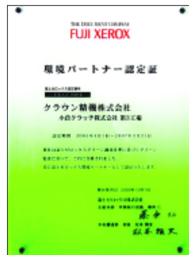
Environmental Certification Received from Fuji Xerox

A t the end of last year Fuji Xerox performed an environmental audit on Ogura's plant #3 in Kiryu, Japan. Plant #3 manufactures micro clutches for use in copy machines, printers and fax machines. The plant passed all aspects of the environmental audit and was awarded the certificate on December 1st. Certification is good through March 2007.