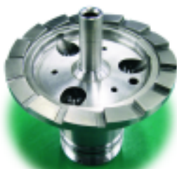
Starter clutch input

Previously the bodies of the hydraulic landing gear actuators (there are actually three used per plane) were sent outside of Ogura for painting. This has been changed to an in-house procedure and although there is not a significant cost savings there is a significant savings in delivery time and an improvement in the quality of the painting.