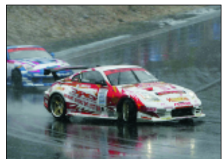
ORC driver in the lead