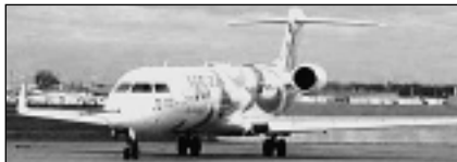
Typical Commuter Jet

Ogura manufactures a number of components for use in jet commuter aircraft. For 2006 a number of production changes are taking place which will allow Ogura to maintain the high quality expected in aircraft components, but at the same time reducing manufacturing cost.