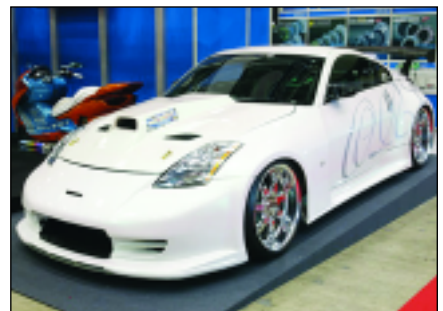
ORC SuperStreet Z took 1st place at the Tokyo Auto show