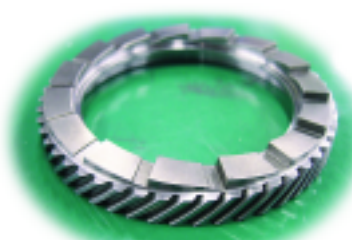
Starter clutch output