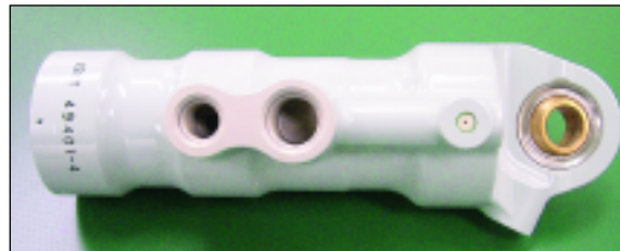
Hydraulic landing gear actuator

The transmission gear drive for the jets is made out of a magnesium composite material which requires sensitive machining. By changing the way the original profile was cut on the housing spline, machining time for this piece has been reduced, providing an additional cost savings.