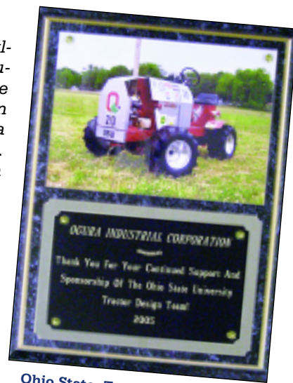
Ohio State Tractor Design Team Wins 3 Events

A plaque acknowledging Ogura's contribution to the 2005 1/4 scale tractor design competition was given to Ogura Industrial Corporation. OIC contributed both product and clutch suggestions for the competition. Finished tractors were judged in 5 performance events measuring both strength and durability of the tractor design. The Ohio State University team received 1st place in 3 of the events and a 2nd place in a fourth event.