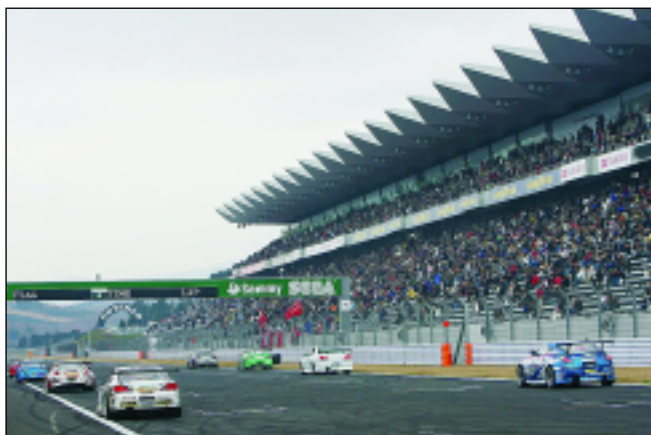
Nismo Race near Mt. Fuji

In Mid December the annual Tokyo Auto Salon was held. Ogura had the new carbon clutch on display along with the new single plate clutch. The race car driver's round table discussion was sponsored by Ogura and once again had a good turn out. But the highlight of the show this year was Ogura's modified Nissan Z (The ORC Super Street). It received 1st place in the high performance tuning competition.